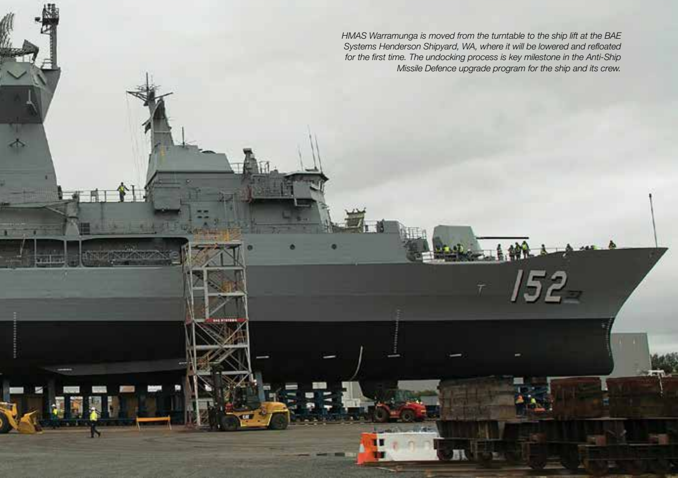
HMAS Warramunga is moved from the turntable to the ship lift at the BAE Systems Henderson Shipyard, WA, where it will be lowered and refloated for the first time. The undocking process is key milestone in the Anti-Ship Missile Defence upgrade program for the ship and its crew.