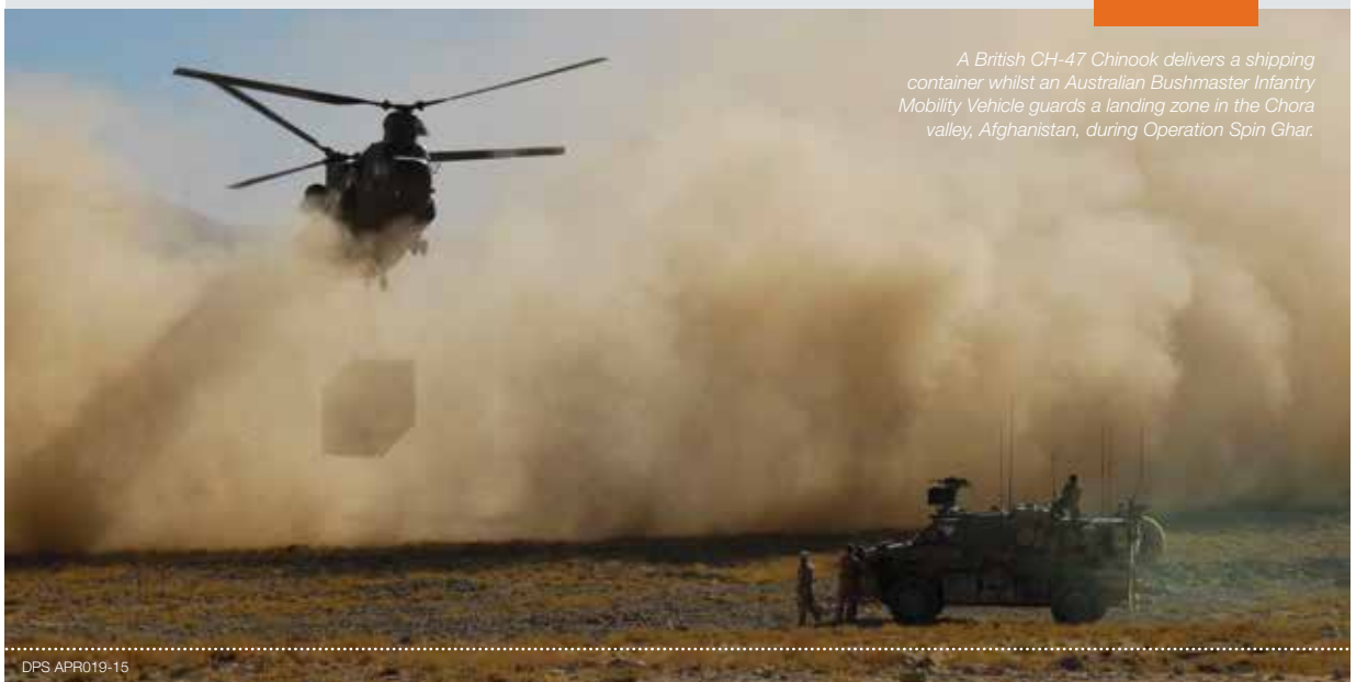
A British CH-47 Chinook delivers a shipping container whilst an Australian Bushmaster Infantry Mobility Vehicle guards a landing zone in the Chora valley, Afghanistan, during Operation Spin Ghar.

www.defence.gov.au/budget (Defence) www.budget.gov.au (all areas of Government)