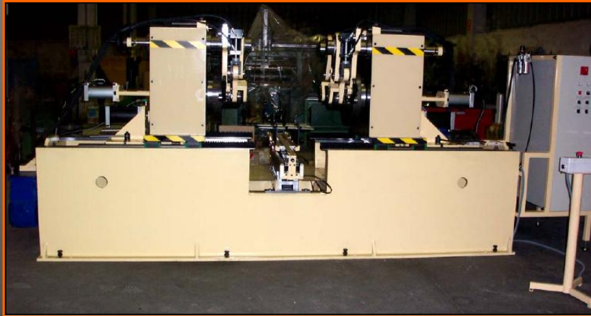
Cap Seamming Machine