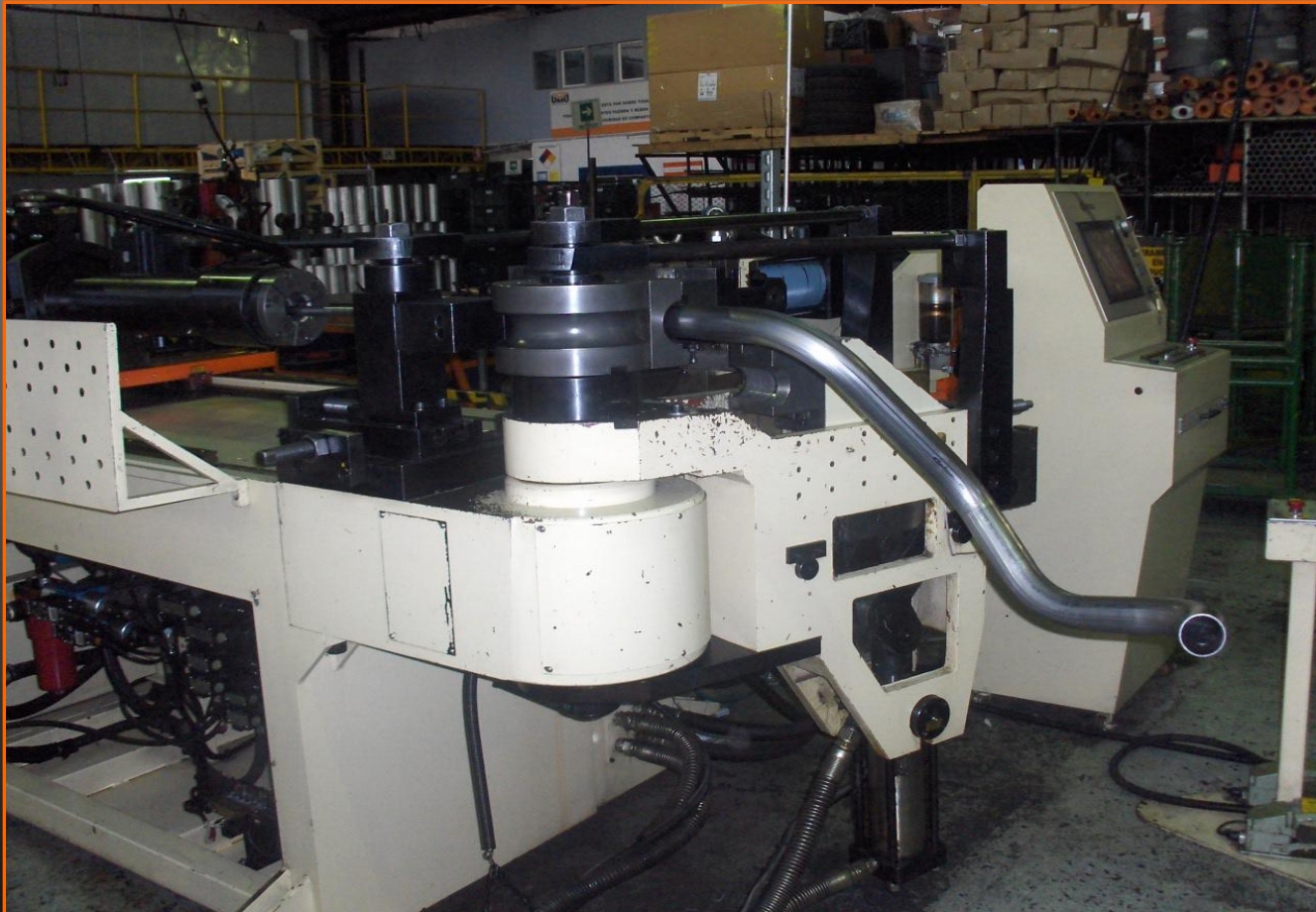
Bending CNC Machine