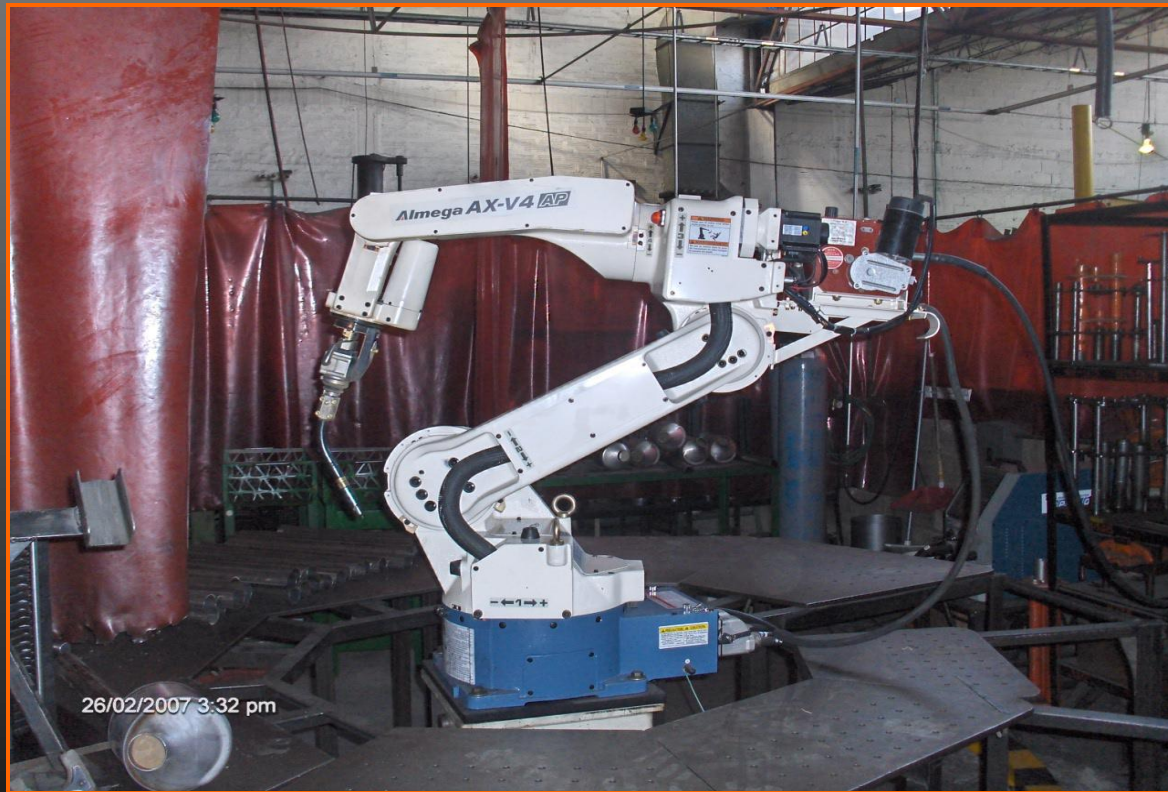
Welding MIG Robot