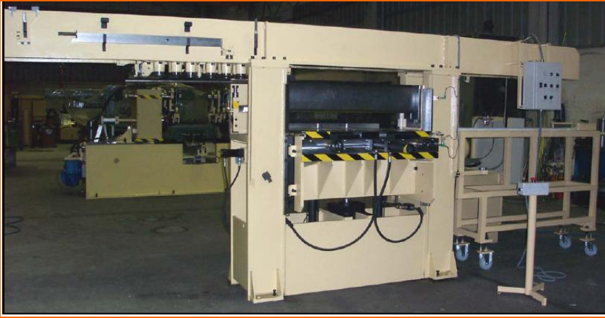
Lock Seamming Machine