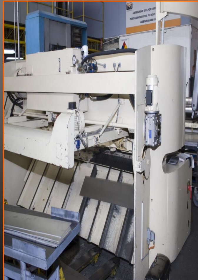
Shear CNC machine