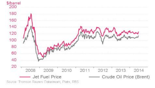
Jet Fuel and Crude Oil Prices

breaking $125/bbl after 3 months of trading slightly below that level. This