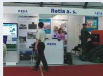
Exhibition FUTURE SOLDIER Prague 2008