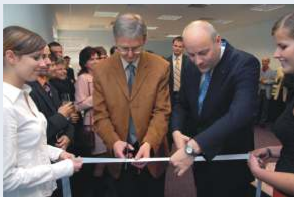
Ceremonial opening new building PRADO