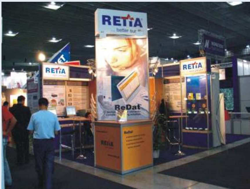
Attendance in trade fare INVEX