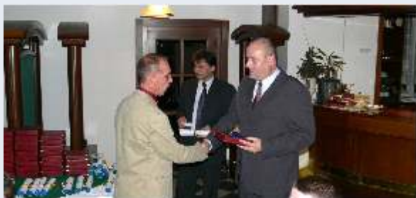
Handover of memorial blazons on the occasion of last site meeting of project ASVRP