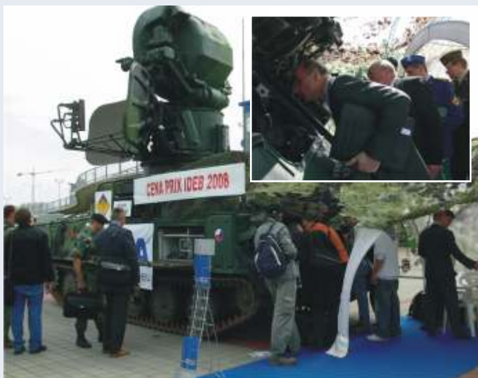
The upgraded system SURN CZ won the prize PRIX IDEB 2008 for the greatest technical contribution and novelty in its category.