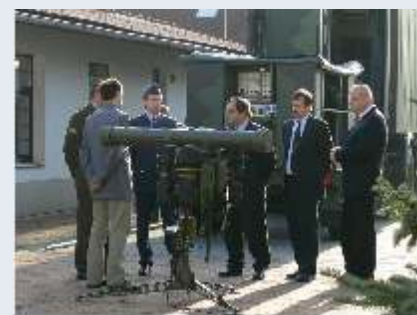
Show of incorporation of RBS70 in ASVRP (RACCOS)