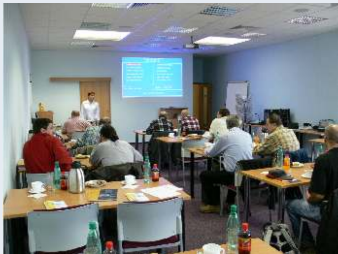
New training room