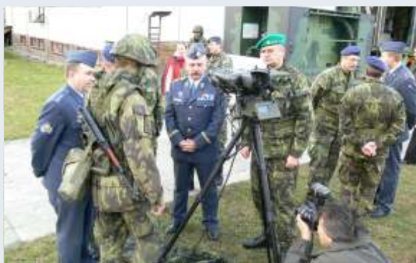
Ceremonial release of system RACCOS in armament 25. plb Strakonice