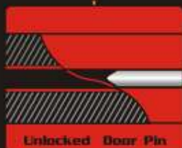
Unlocked Door Pin