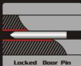
Locked Door Pin