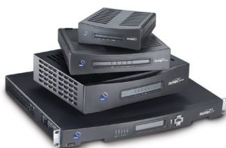
SkyEdge II VSAT Terminals