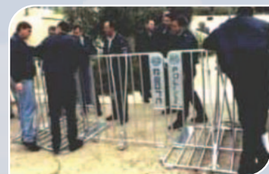
Approved and selected by the Israeli Police