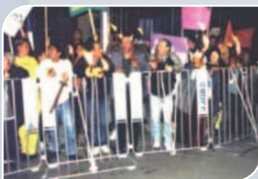
In Use in Demonstration

The MCCB is based on an innovative concept resulting in a cost-effective highly effective solution.