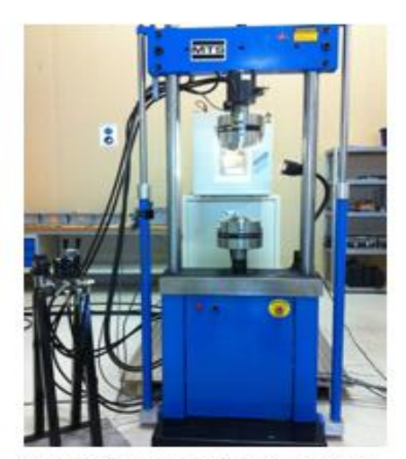
MTS 100kN Mechanical Test Bench for Both Static and Dynamic