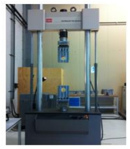
MTS 500kN Mechanical Test Bench for Both Static and Dynamic