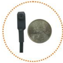
* External Microphone (PAW-100i)