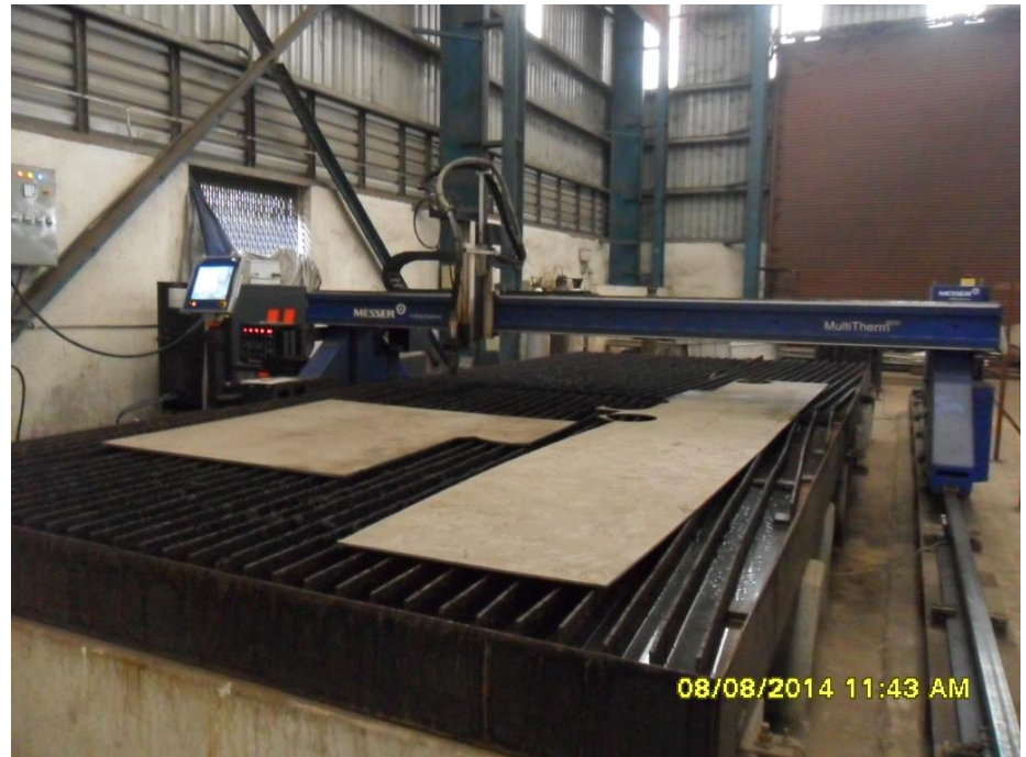
CNC Plasma Cutting