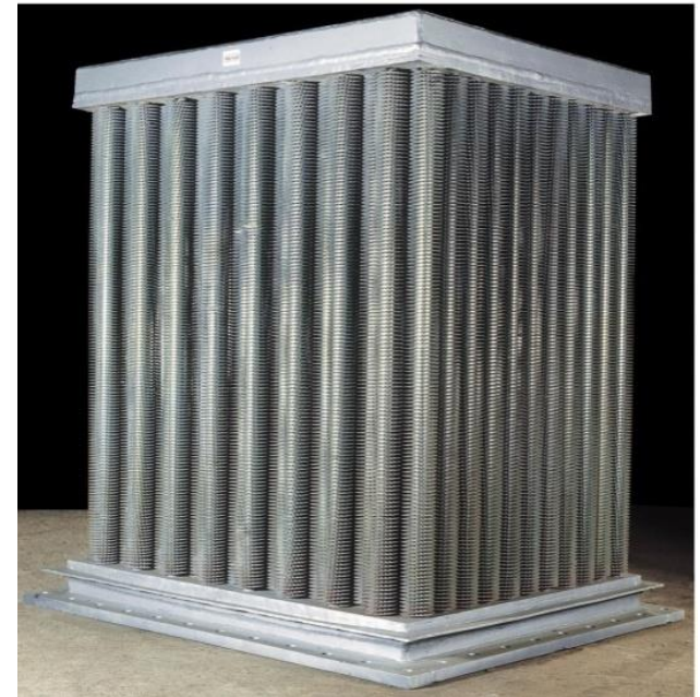
Finned Tube Heat Exchanger