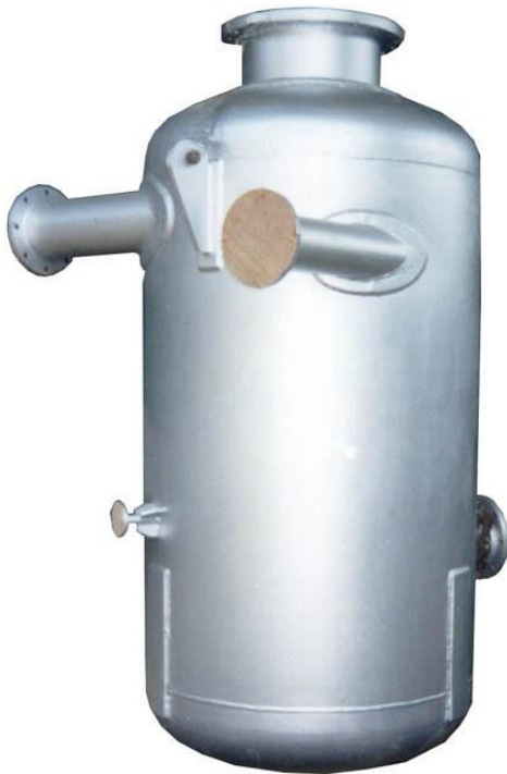
Air Receiver Tank