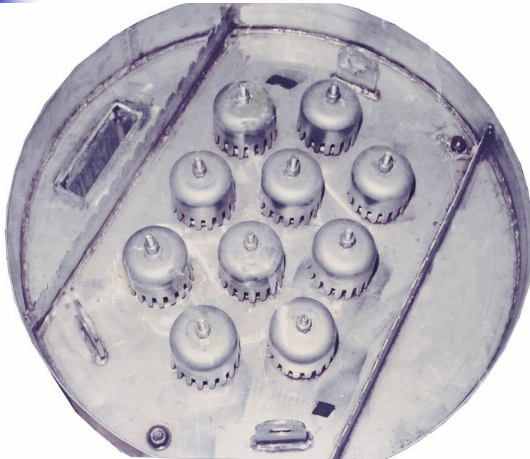
Bubble Cap Tray Assembly