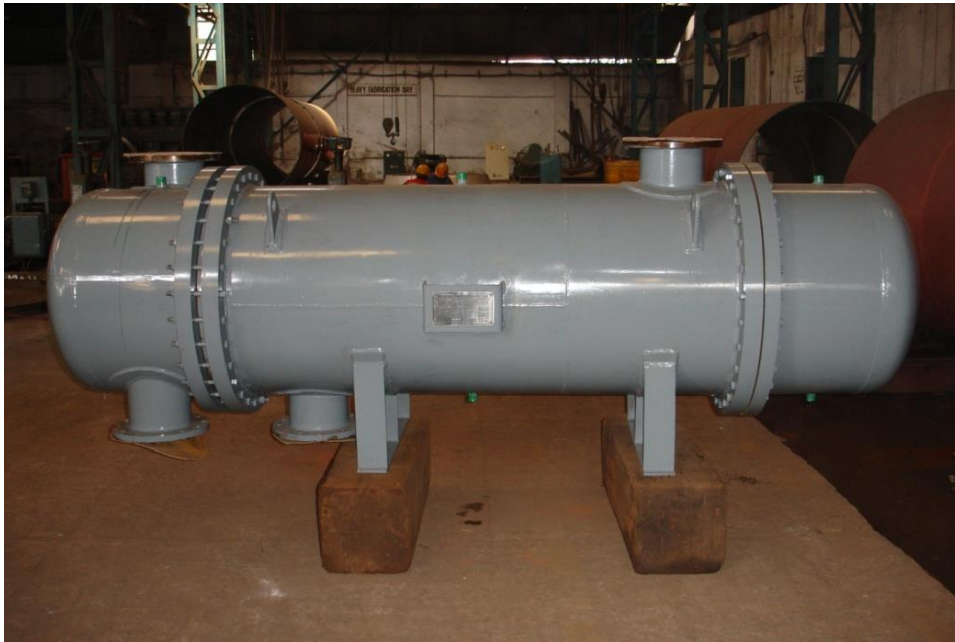
Shell & Tube Heat Exchanger