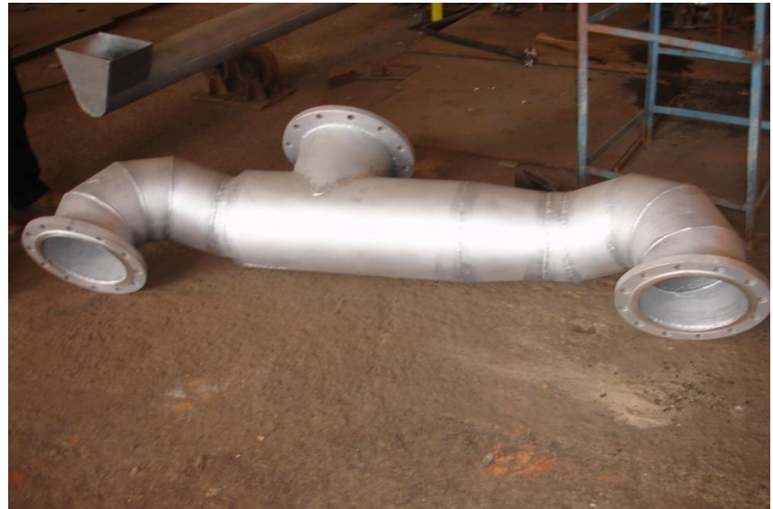
Pipe & Duct Assembly