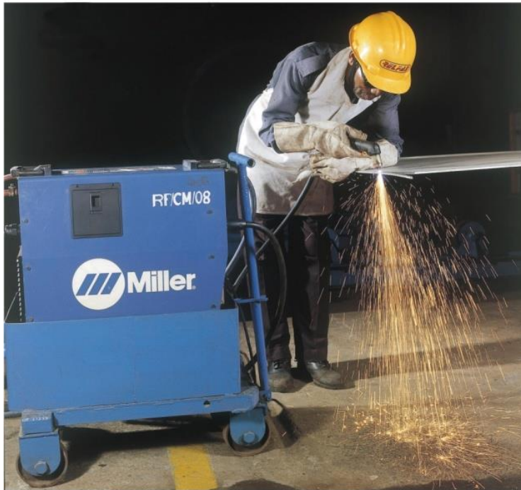
Air Plasma Cutting