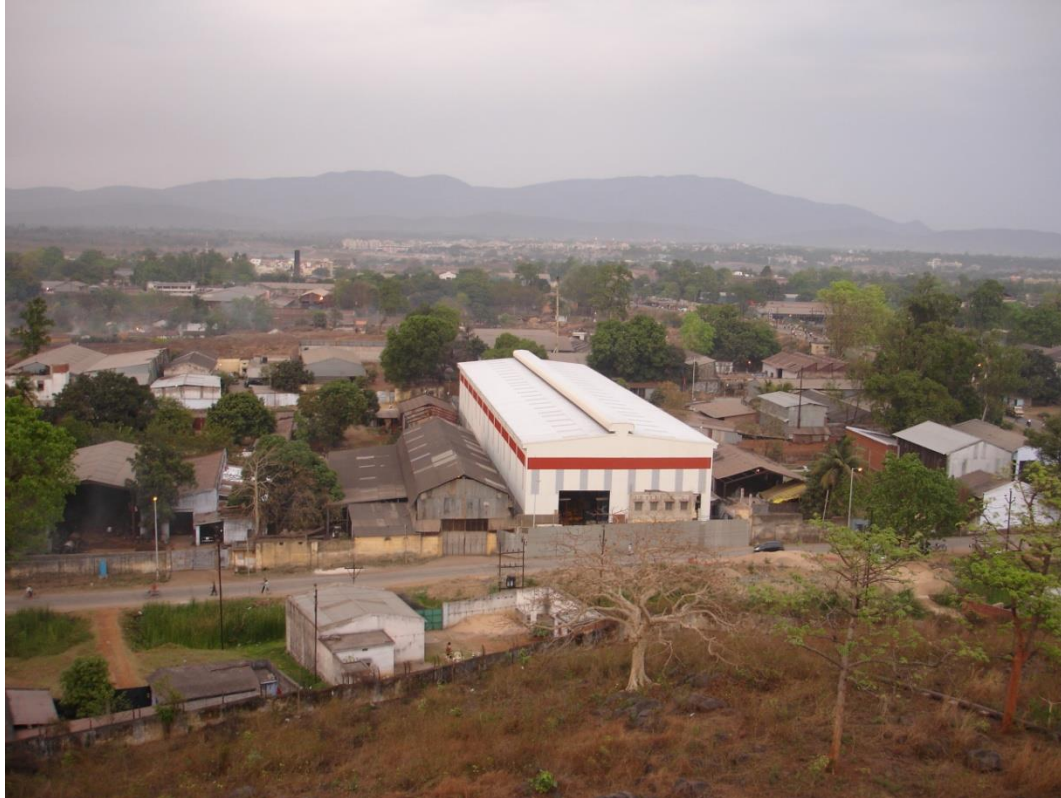
Bird's Eye View of the Plant