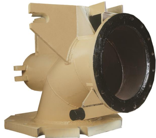
Goose Neck for Blast Furnace