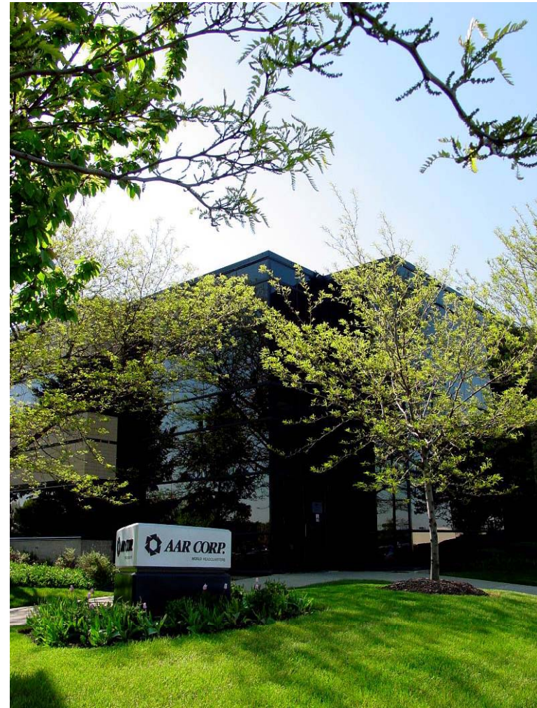
AAR World Headquarters in Wood Dale, Illinois