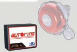
Detects a notice message and activates a ring. Special for high noise factories.