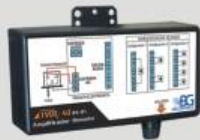
Remote Audio Amplifier