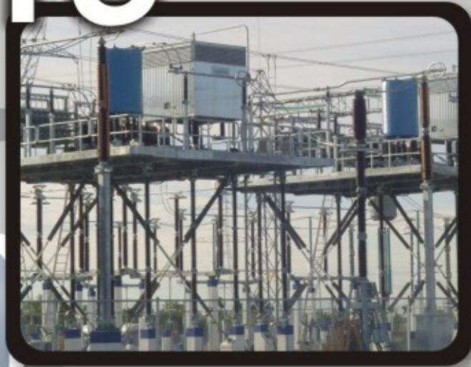
CFE - Mexico