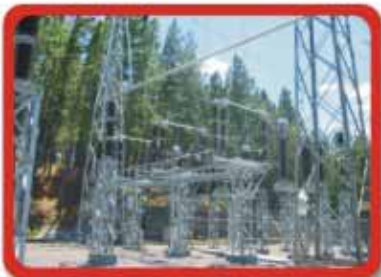
Celmec substation - Panama