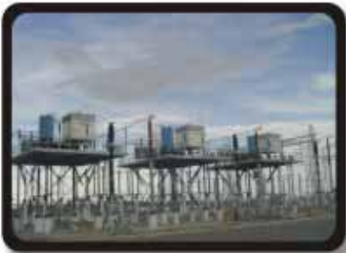
Comisión Federal de Electricidad Mexico