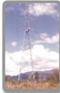
Instituto Costarricense de Electricidad - Costa Rica