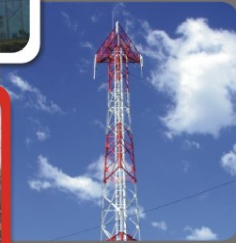
COLOMBIA MÓVIL - Colombia