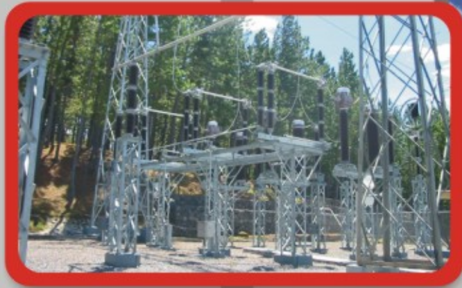
ETESA - Panama