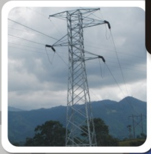
Café Highway Colombia

Quality and Engineering at a Country's Service