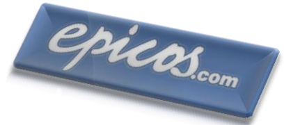
Defence Industry Exports

exports increased from 47 in 2006 to 80 in 2014. In the past, the main export of the ROK's defence industry were ammunition and small arms, however, these has been changed as recently the ROK's defence industry also exports aircraft, submarines and logistics support vessels. Finally, it is worth mentioning that defense industry exports reached $3.4 billion dollars for the first time in 2013, recording an accumulated amount of $12 billion dollars for the period 2006-2013.