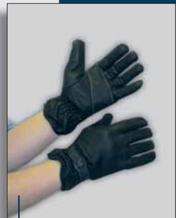
Model: Rg104 B