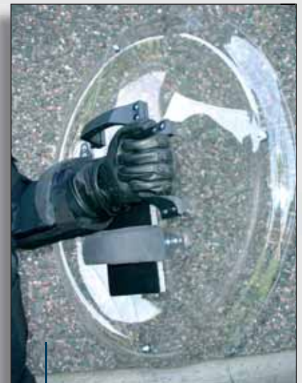
Model: Rs 065

We also have a round shield based on the same technology used in our rectangular shield. It has a 65cm diameter.