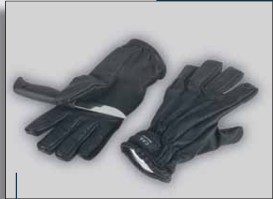
Model: Rg104 C

Certified to ISO EN standard. Cut resistant inner lining. Impact protection the same as our Model Rg106.