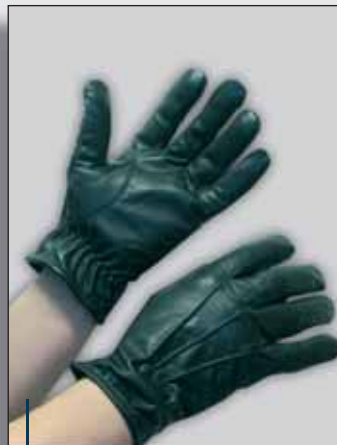
Model: Rg104 A

Flexible for a good feel and grip for weapons handling, these cut resistant gloves have a cut resistant lining for extra protection.