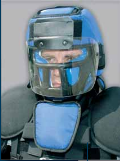
Model: The05 (with half visor)

The training helmet protects the head, the neck, face, and throat. It consists of three parts, the inner helmet, the outer shell, and the visor. It is a perfect helmet for Simunition training too if it is used together with our Neck Guard and Lexan visor.