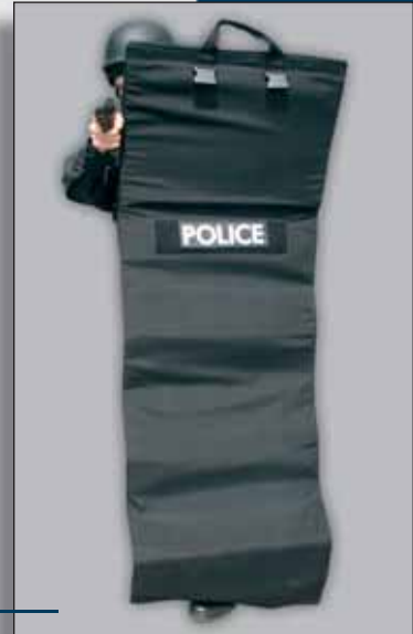
Car Blanket/ Flexible shield Model: Bcarb

Within seconds, a car door can provide effective protection against light weapons, bomb fragments, and blast. Designed to provide protection for incident negotiators, it can also act as a ballistic shield. Lightweight and easily stored, it deploys in seconds.