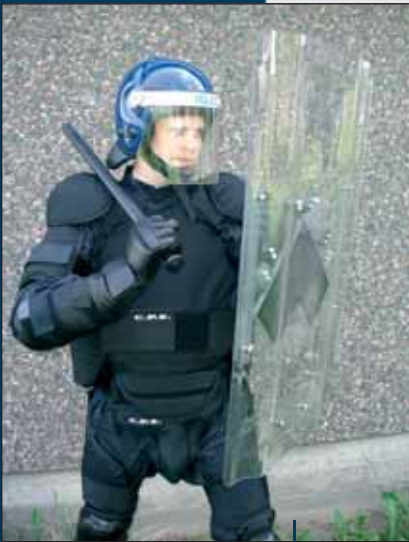
Model: Rs 100/120/ 165/195

The same protection level as Model 01, but does not afford the same protection to the side of the leg. Instep is only partially protected.